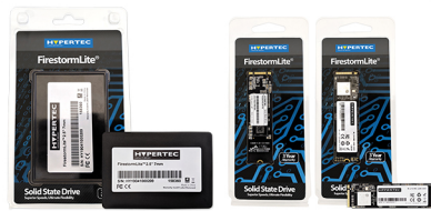
▶ Solid State Drives (SSD)