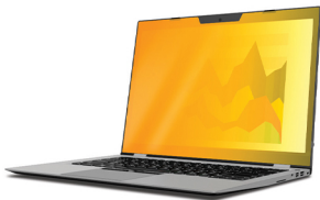
▶ 3M™ Privacy Filters