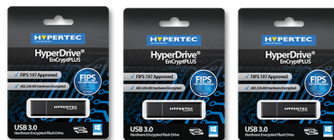
▶ Encrypted Flash Drives