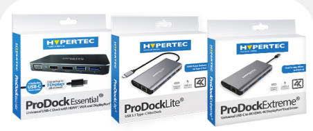
▶ Docking Stations