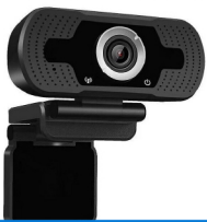
▶ HD USB Webcam