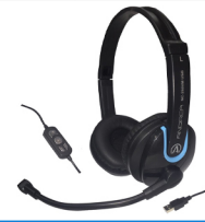
▶ USB Headset