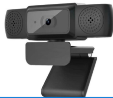
▶ 4K USB Webcam