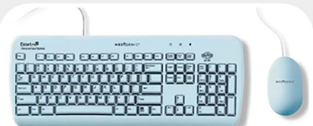
▶ Sterile Keyboards & Mice

For more information about the Hypertec Product Range, contact your Hypertec Account Manager today.